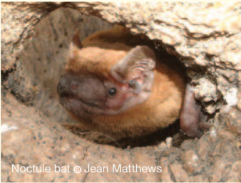
Noctule bat

An introduction to roadside trees and hedges in relation to safety works, wildlife issues and Tree Preservation Orders