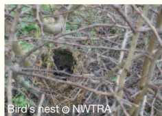
Bird's nest